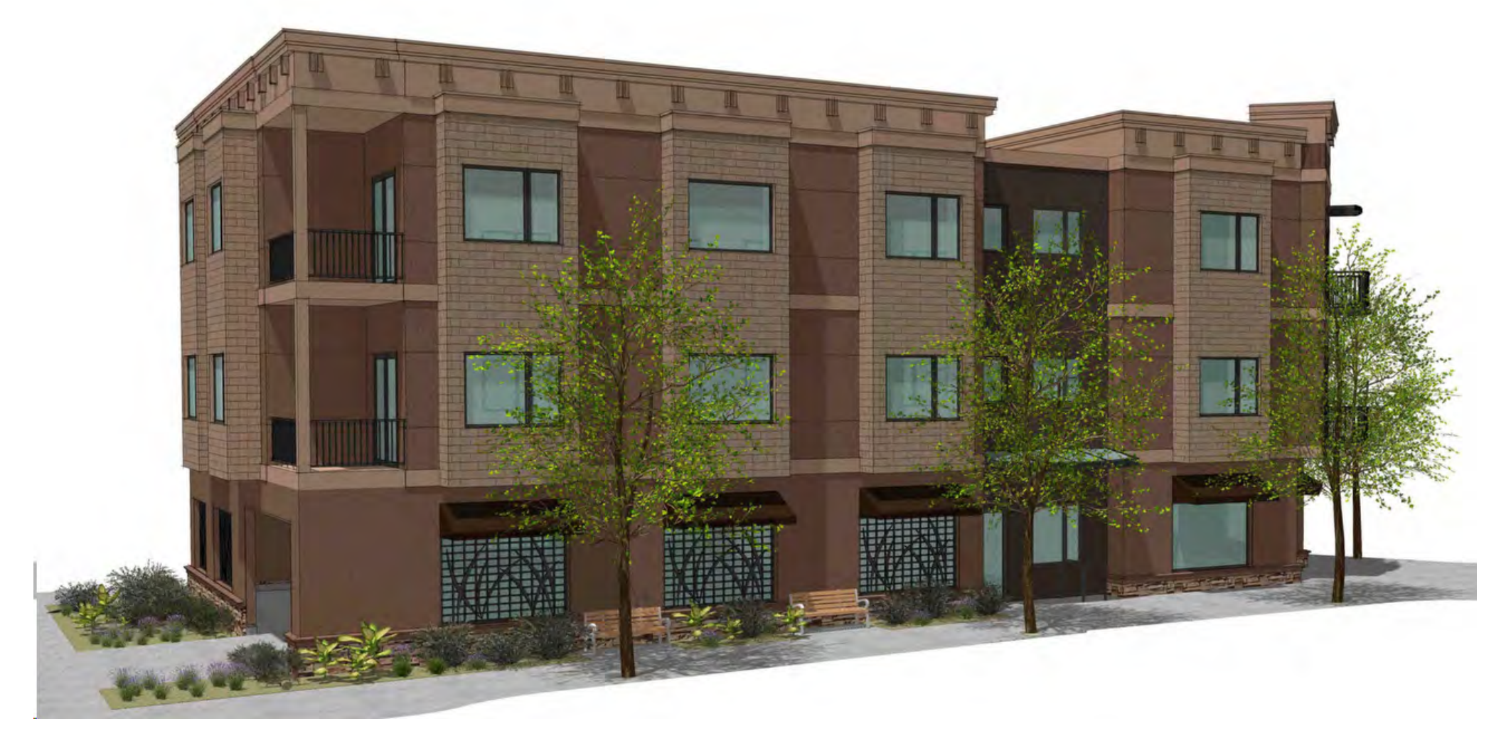
Residential/Commercial Building with Residential Ground Floor Option