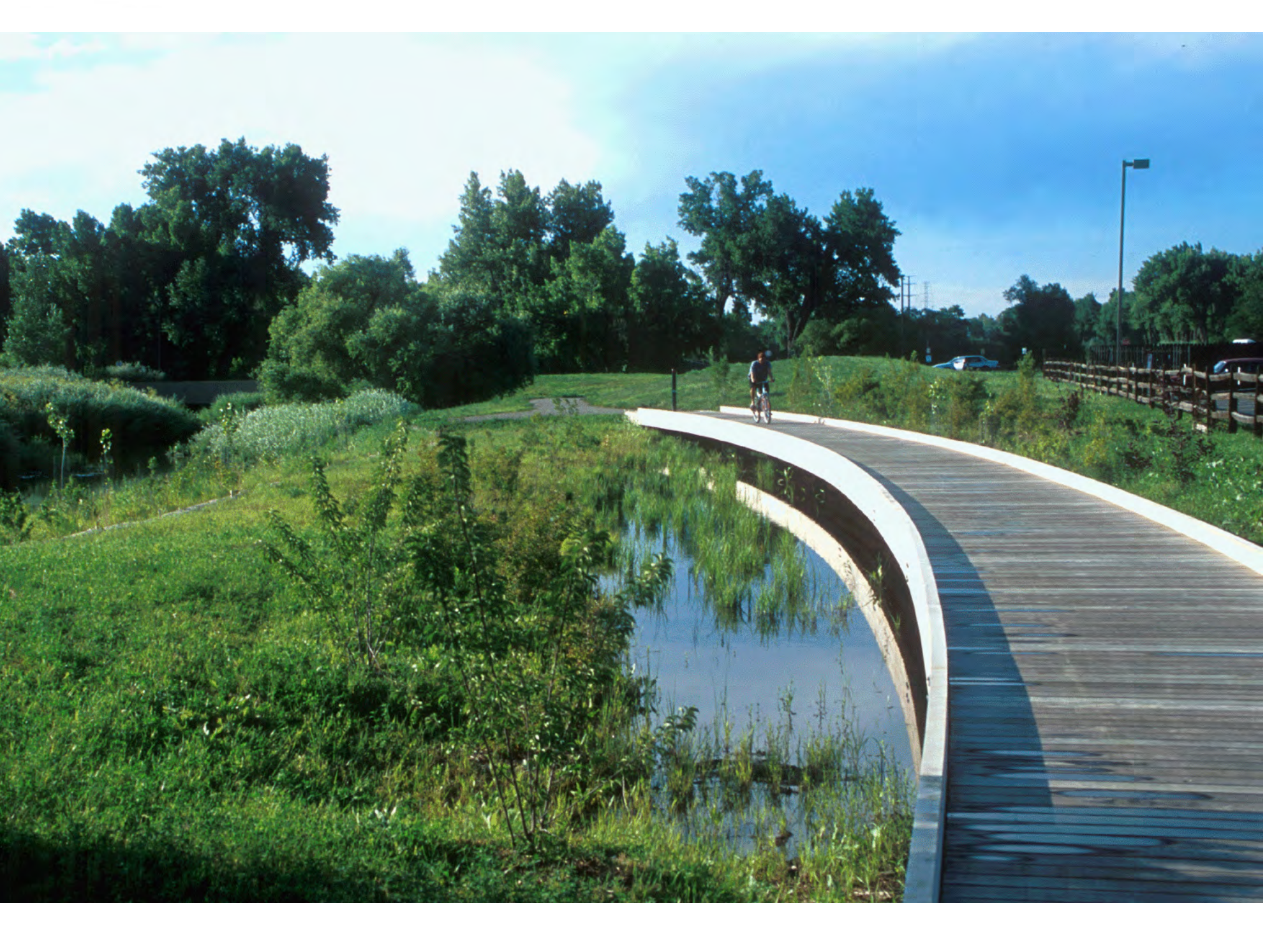
Bike/Ped Options in Conservation Area