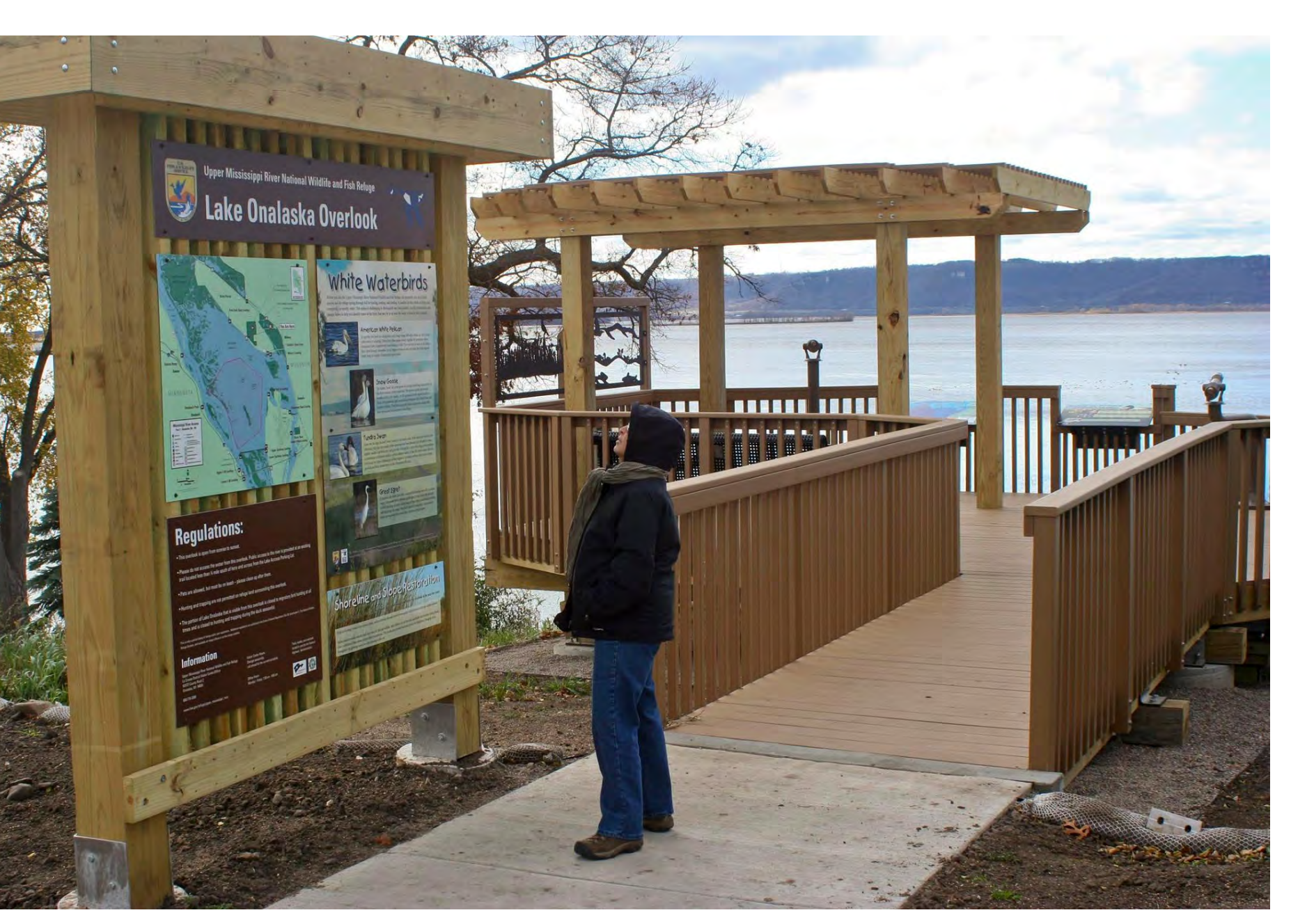
Possible Wildlife/Wetlands Viewpoint