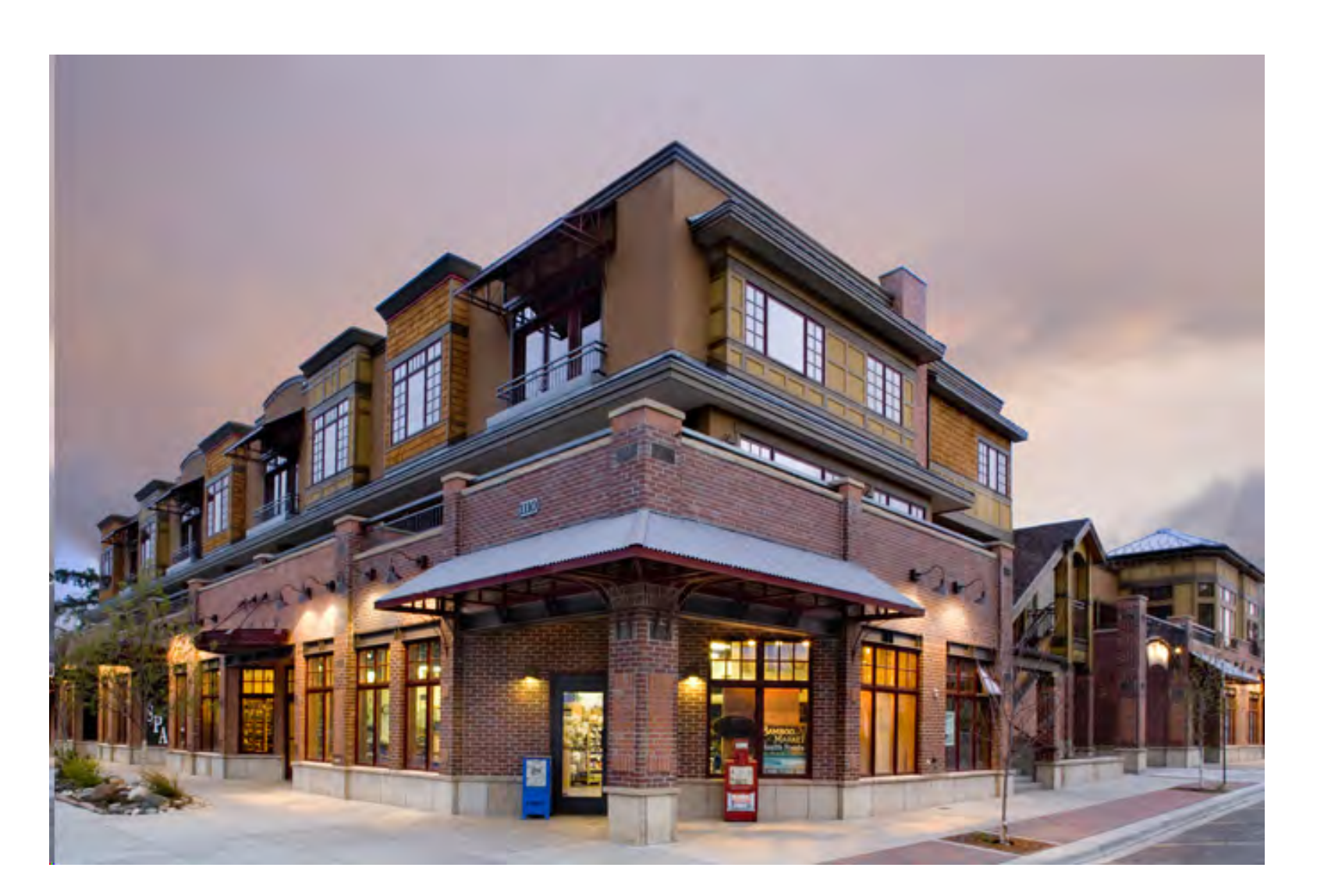
Residential/Commercial Building - Ground Floor Commercial